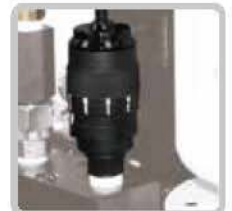
● Pressure Adjuster