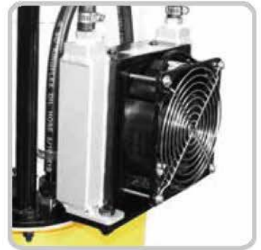
● Air-Cooled Heat Exchanger