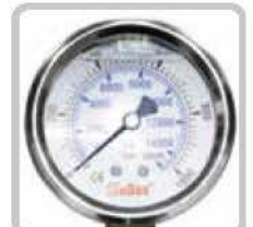
● Pressure Gauge