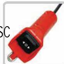
● Optional remote controller, shall order separately.